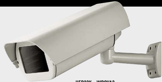
HEB32K + WB0VA2